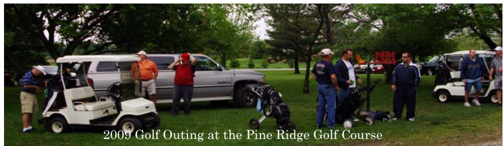
2009 Golf Outing at the Pine Ridge Golf Course